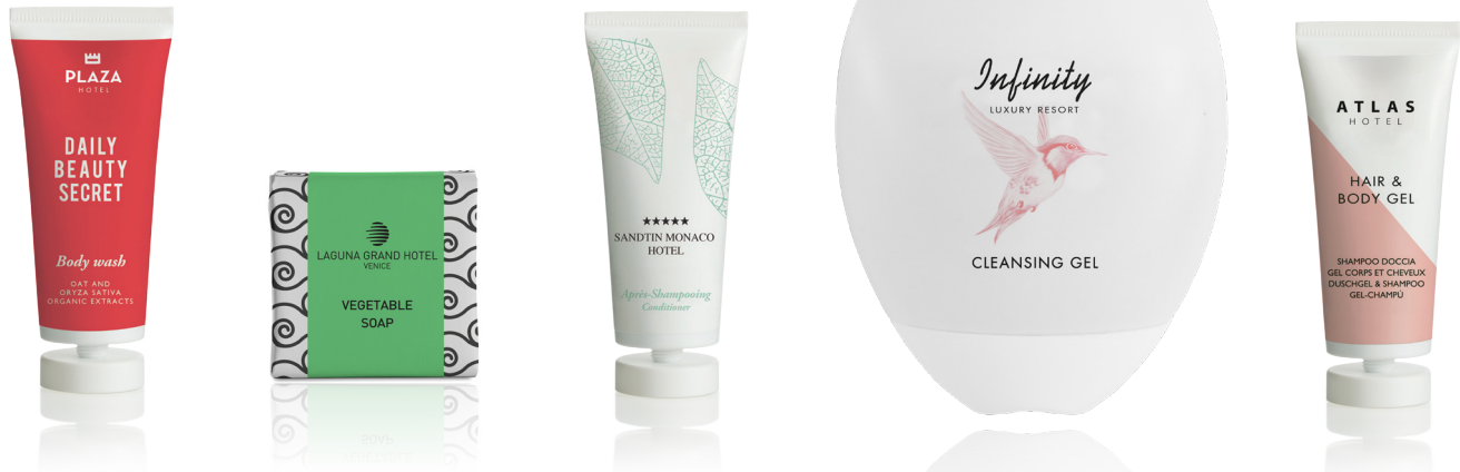
CUSTOMIZATION WITH SAME RANGE COLOURS

*this option is subject to a surcharge. See price list for details.