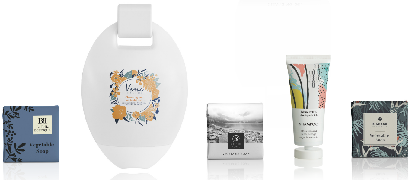
CUSTOMIZATION WITH CUSTOM COLOURS