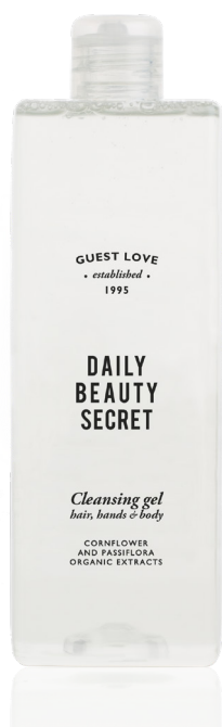
CLEANSING GEL 480 ml 16.23 fl. oz. FLR500MGL

This cleansing gel is enriched with cornflower and passiflora organic extracts with relaxing properties for a delicate wash leaving hair and body feeling invigorated and vibrant.