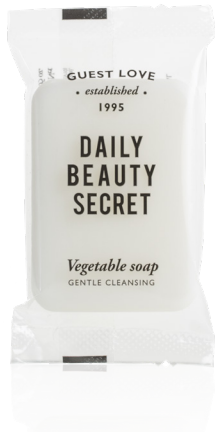
VEGETABLE SOAP 30 g Net wt. 1.05 oz. B0830GL