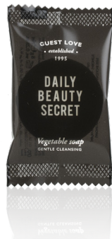
VEGETABLE SOAP 8 g Net wt. 0.28 oz. B0808GL