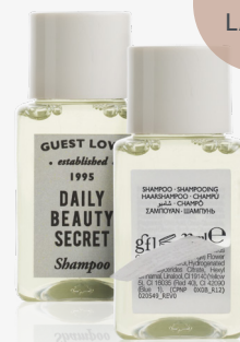
22 ml e 0.74 fl.oz.