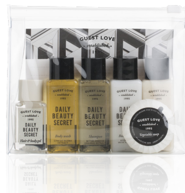
POCHETTE AMENITIES 15 x 12,5 x 4,5 cm K052GL

DERMATOLOGICALLY TESTED NICKEL TESTED NO BHT NO PETROLATUM