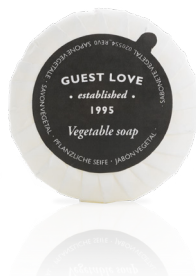
VEGETABLE SOAP 20 g Net wt. 0.70 oz. B0220GL

This vegetable soap is the ideal body care bar to use on a daily basis. Its gentle cleansing action can be used all over the body to leave the skin clean and refreshed.