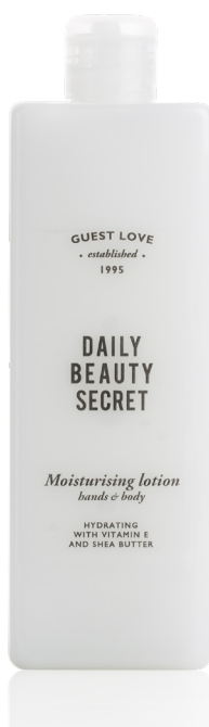
MOISTURISING LOTION 480 ml 16.23 fl. oz. FLR500BLGL

DERMATOLOGICALLY TESTED NICKEL TESTED NO BHT