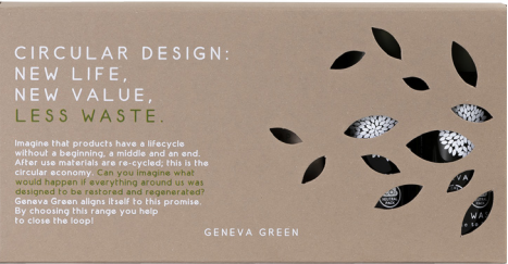
SMALL AMENITIES PAPER BOX 16,4 x 8 x 2,7 cm

CAMP5GR Contains 4 x P30 bottles - 30 ml e 1.01 fl.oz. and 1 x B0915GR soap - 15 g e Net wt. 0.52 oz.