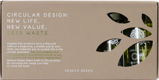
BIG AMENITIES PAPER BOX 17 x 8,5 x 3,2 cm

CAMP5GR Contains 4 x P30 bottles - 30 ml e 1.01 fl.oz. and 1 x B0915GR soap - 15 g e Net wt. 0.52 oz.