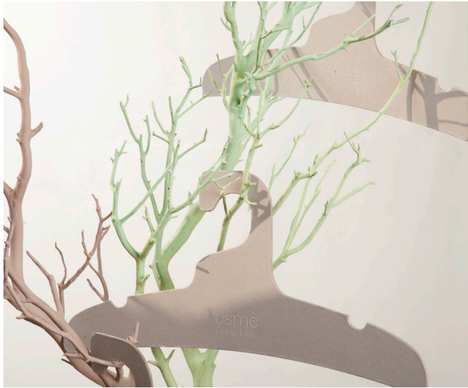
CLOTHES HANGER AP045SM