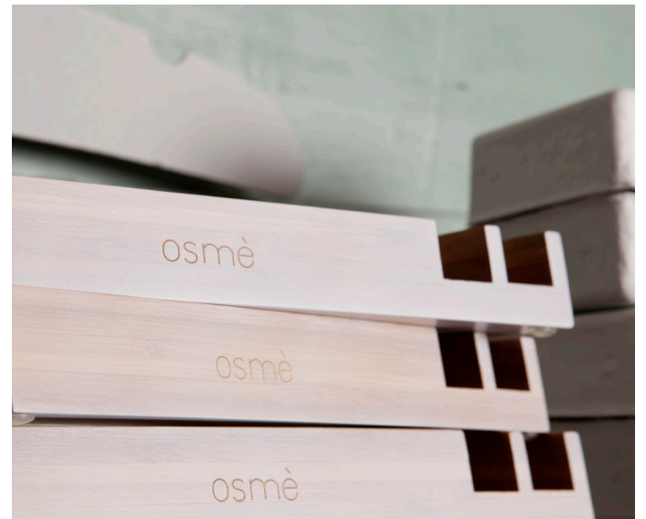
BAMBOO TRAY I075SM