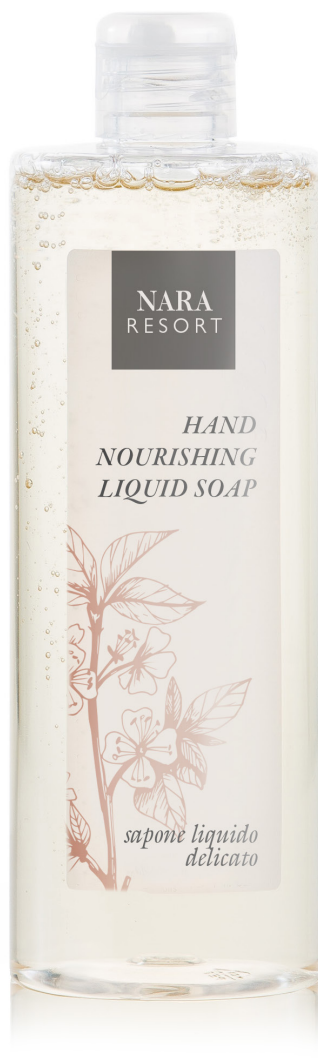
CUSTOMIZATION WITH SAME RANGE COLOURS