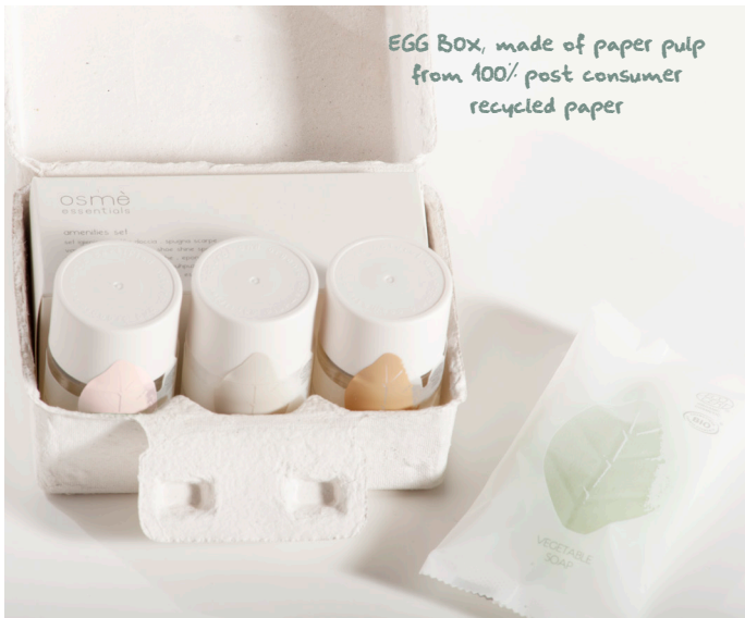
EGGBOX GIFT BOX K065SM