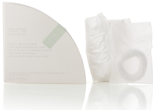
SHOWER CAP AND HAIR BAND in paper case C024SM