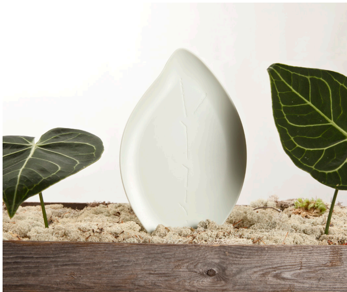
LEAF SHAPED TRAY in ABS I045SM