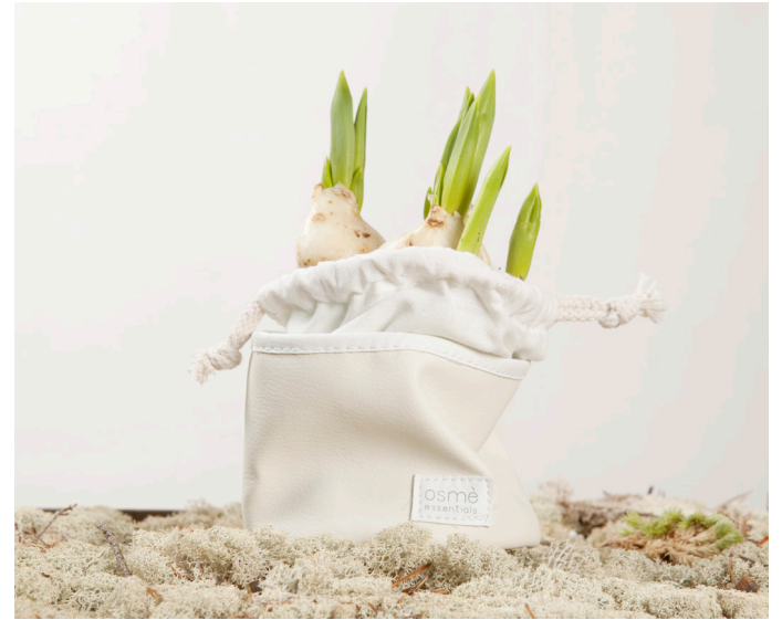
ESSENTIALS KIT POUCH K075VSM