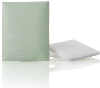
SHOE SHINE GLOVE in paper sleeve F03SM