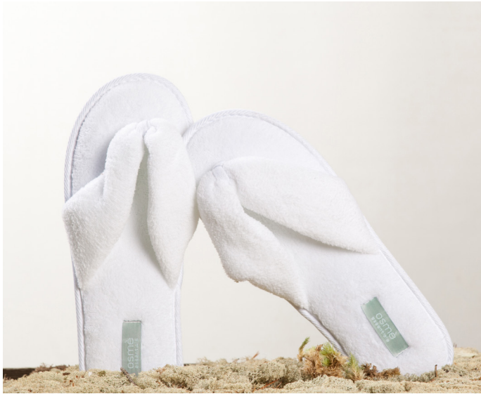
EXTRA SOFT COTTON SLIPPERS F085SM