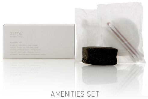
AMENITIES SET in paper case K045SM

PAPER BOXES Inner bags are partially derived from the natural and renewable source of corn starch.