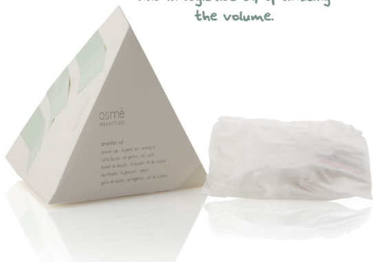
PYRAMID BOX in paper case K045PSM

PYRAMID Box delivered flat to reduce consumption during transport and in logistics by optimizing the volume.