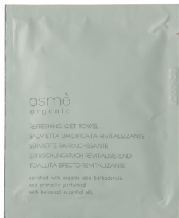
REFRESHING WET TOWEL AB50SM

NO BHT / NO EDTA / NO SLS-SLES / NO SILICONES / NO MINERAL OILS / NO COLOURANTS / NICKEL TESTED / VEGAN FRIENDLY