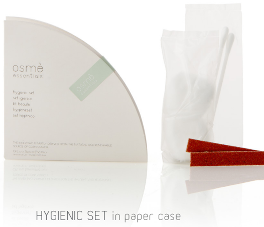
HYGIENIC SET in paper case DE024SM