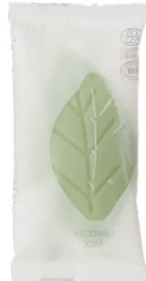
VEGETABLE SOAP 18 g e Net wt. 0.63 oz. B1218SM

NO BHT / NO EDTA / NO SLS/SLES / NO SILICONES / NO MINERAL OILS / NICKEL TESTED / VEGAN FRIENDLY