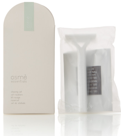
SHAVING SET in paper case E0114SM