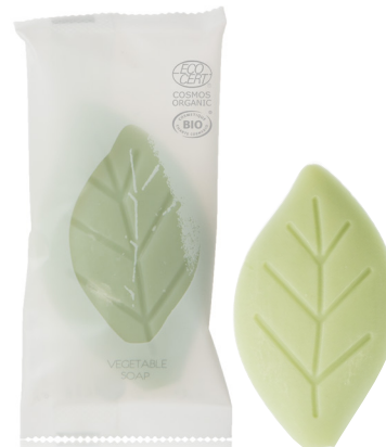
VEGETABLE SOAP 35 g e Net wt. 1.23 oz. B1236SM

NO BHT / NO EDTA / NO SLS/SLES / NO SILICONES / NO MINERAL OILS / NICKEL TESTED / VEGAN FRIENDLY