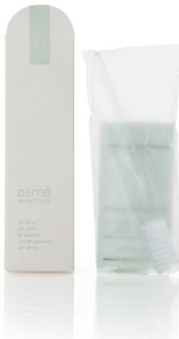
DENTAL SET in paper case E094SM