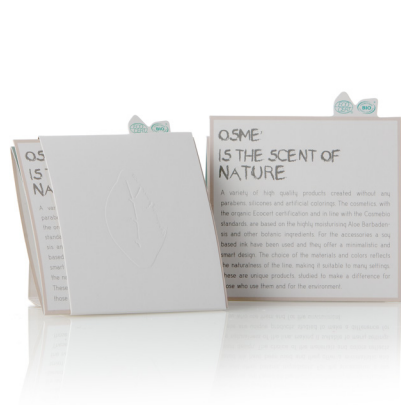
ADVERTISING CARD SCRTSM

PAPER BOXES Inner bags are partially derived from the natural and renewable source of corn starch.