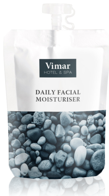
CUSTOMIZATION WITH CUSTOM COLOURS